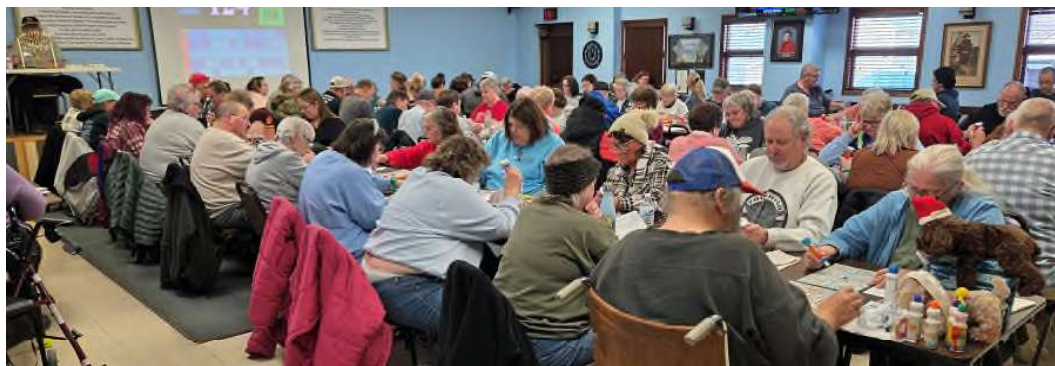
Bingo Feb. 22

The SAL would like to give a big thank you to Shoe Sensation for their generous donation of over 300 pairs of socks. These socks are destined for the VA hospital in Madison where they will be distributed to veterans in need. Thank you Shoe Sensation for your generosity.