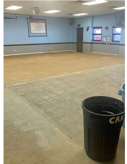
Dining Room has a new look; Legion members stripping; bare floor (upper right) and the new surface (above)