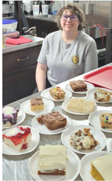
Always yummy desserts