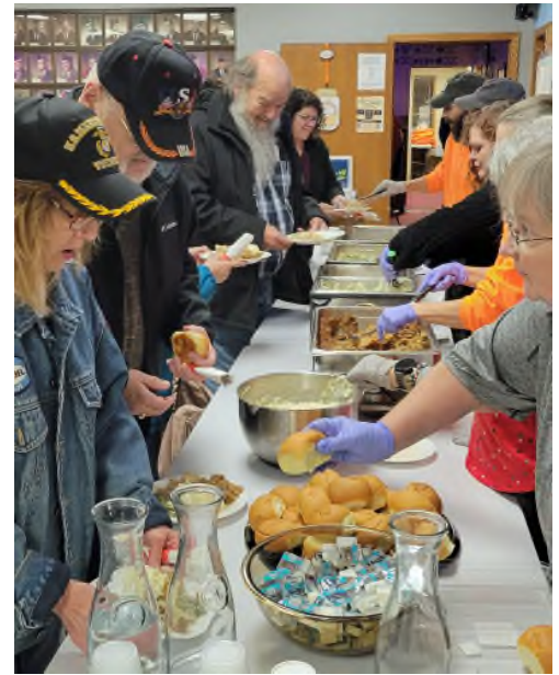
Veterans Day dinner was well attended at the Post, photos above. The Color Guard was at Monroe High School event, below.