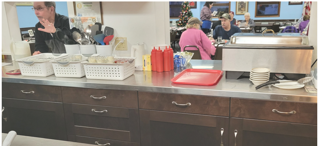
The new counter-top was in use at the Dec. 29 Fish Fry. Below is how the new implements look from the dining area.